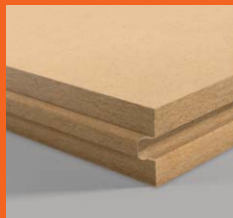
AGEPAN® THD cover M