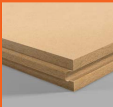
AGEPAN® THD etics M